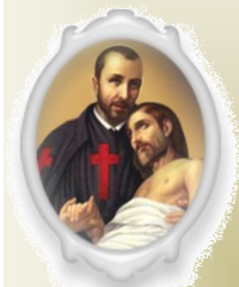
St. Camillus De Lellis

Camillus de Lellis was a soldier who fought against the Turks when he was 17. After contracting a disease on his leg, he became both a patient and an orderly at San Giacomo hospital in Rome, but was forced to leave due to his quarrelsome behavior. Because of his gambling habit, by the age of 24, St. Camillus had lost all his possessions.